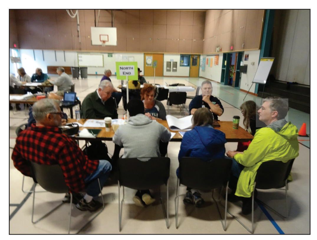
Figure 1. Everett City community stakeholders developing hazard driven stories supporting the preparation of the Hazards Mitigation Plan. On the table are story templets having three columns for notes on community context (community values and supporting assets), changes (earthquakes), and resolutions (retrofitting vulner-able homes).

The Everett City HMP was intentionally designed to follow a very similar story-telling public process. We could not take months to reach a resolution as described in the Alaska example above, but we could create a noncharged, positive atmosphere that was