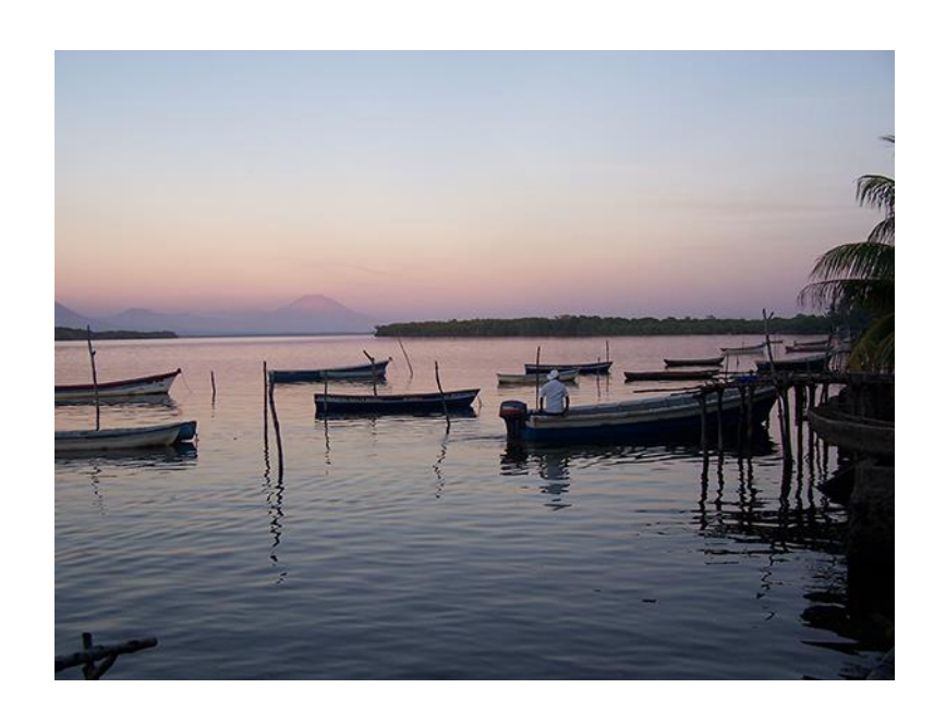
Pesca limpia fishermens' boats on the Bay of Jiquilisco, at Isla de Méndez.