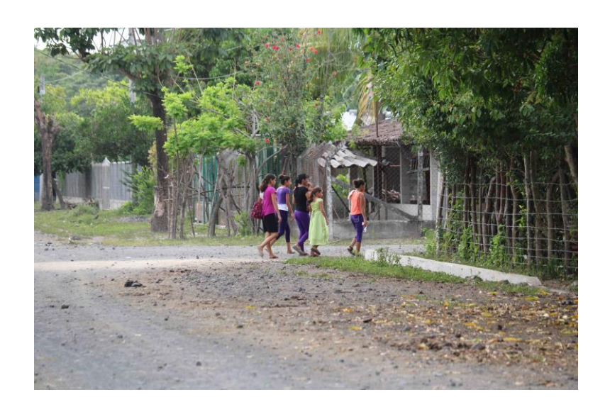
Girls walking in Ciudad Romero.

The four community fishing cooperatives of Puerto Parada , on the northern eastern edge of the Bay of Jiquilisco, under the leadership of their more recently formed local Coordinadora de Puerto Parada and its NGO, Sinkahuite, are dedicated to developing sustainable economic livelihoods through pesca limpia, particularly in order to counteract the destructive human and environmental consequences of blast fishing, the highly unsustainable practice of dynamiting or blasting fishing waters to raise large numbers of fish to the surface for easy collection. In the area now known as Puerto Parada, salt production was a principal activity at the beginning of the twentieth century, a cooking process requiring the use of firewood, which was conveniently and excessively extracted from the surrounding mangroves. Later, the large family landholdings were planted with corn, cotton and rice, and served also for extensive cattle raising. Animal waste and the run-off from the heavy application of agrochemicals, particularly in the cotton plantations, began to contaminate the bay, causing the death of numerous wildlife species. Aggravating this situation in the 1960s and 70s was the increasing use of trammel or gillnets for fishing in the bay's bio-rich channels and estuaries, leading to severe over-exploitation and habitat degradation.